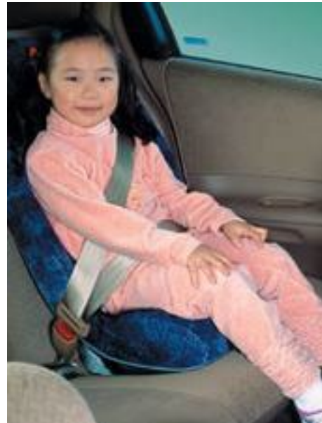
Belt-positioning booster seat