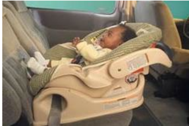
Infant-only car safety seat