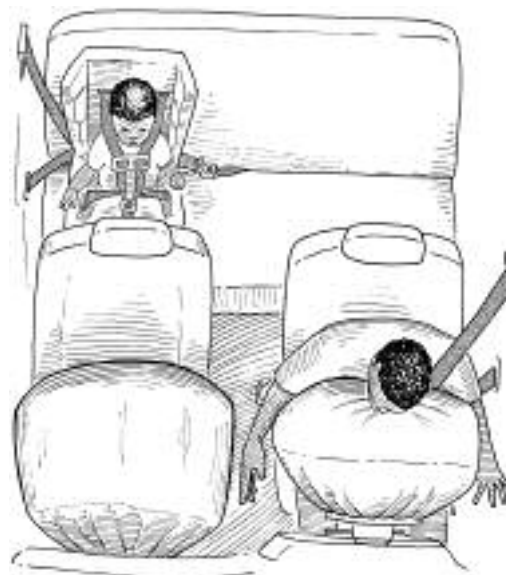
The safest place for all infants and children younger than 13 years is in the back seat.

The information contained in this publication should not be used as a substitute for medical care and advice of your family's physician. There may be variations in treatment that your family's physician may recommend based on individual facts and circumstances. Artwork provided by the Transportation Safety Training Center, Virginia Commonwealth University.